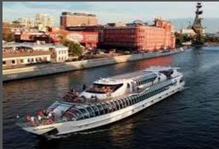
Boat cruises are a great way to go sightseeing.