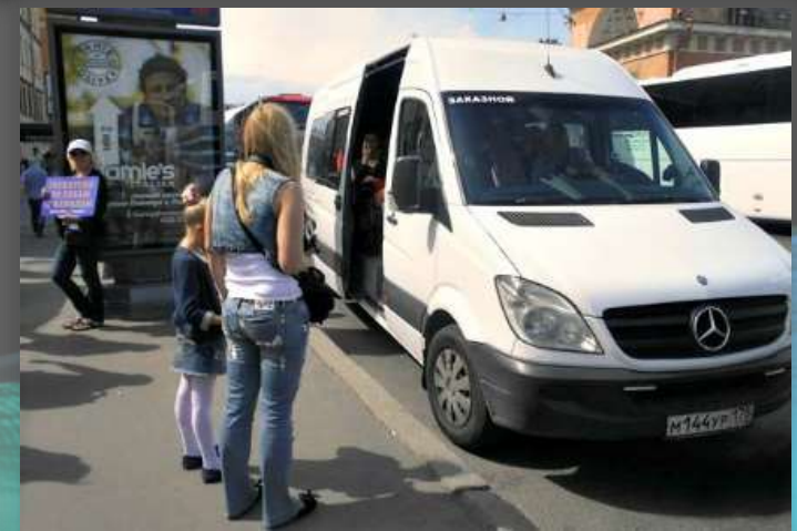
Comfortable AC buses of all sizes.