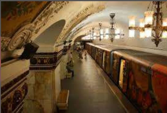
Moscow metro train stations are arguably the most beautiful in the world.