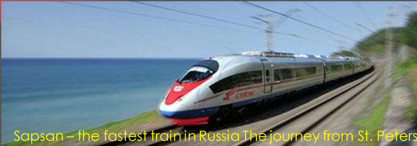
Sapsan – the fastest train in Russia The journey from St. Petersburg to Moscow takes about 4 hours.